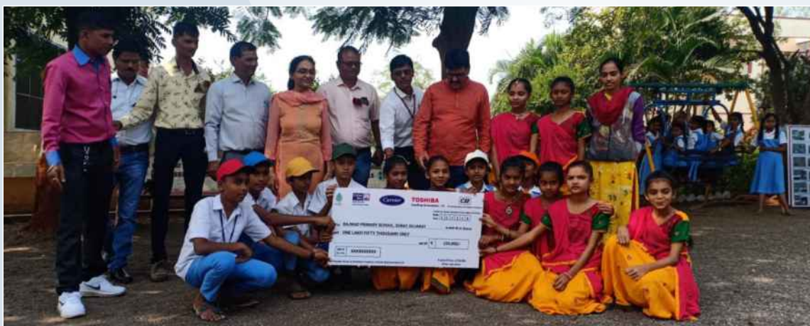
Rajwad Primary School, Gujarat