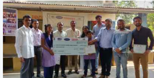
Chikatiya Primary School, Gujarat