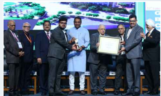
Awards - Performance Challenge for Green Built Environment 2019