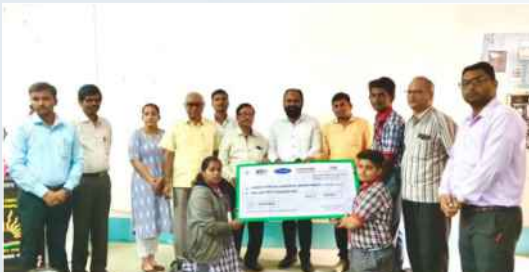
Kendriya Vidyalaya, Anantapur