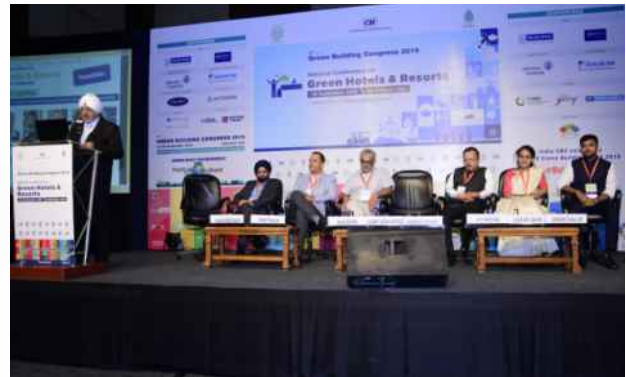
Session 2 – Special Plenary and Panel Discussion: Customer Experiences and Expectations on Sustainability