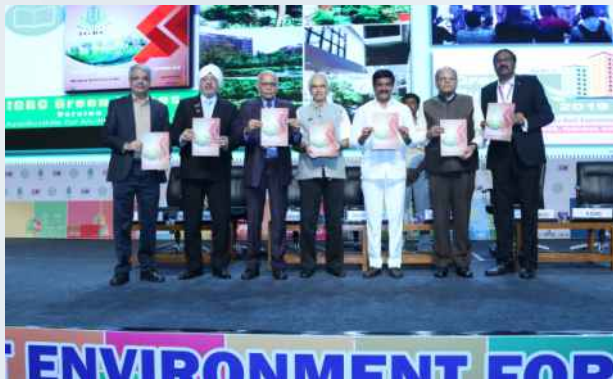
Launch of IGBC Green Homes Version 3.0

The conference concluded with an exciting panel discussion on Financial Mechanisms and emerging opportunities in Residential Projects