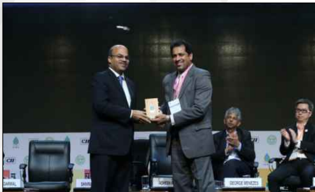
ICICI – Rural Self Employment Training Institute (RSETI) - Jodhpur