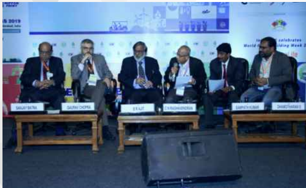
Session 1 - Green Agenda - Perspectives of Architects and Designers

The conference was divided across four sessions, each aimed to highlight the most important aspects of the hospitality sector