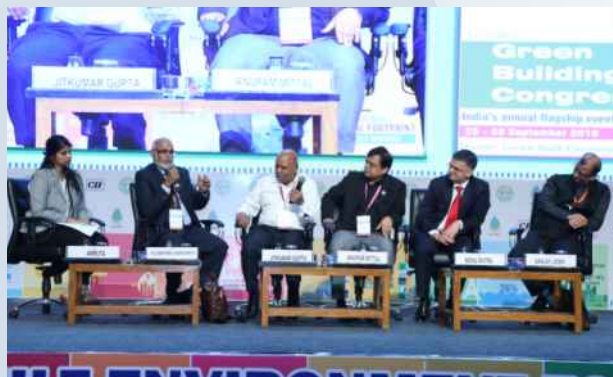
Session 4 - Financial Mechanisms and emerging opportunities in Residential Projects