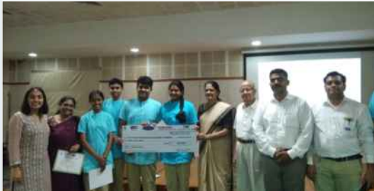
Chettinad Harishree Vidyalayam, Chennai