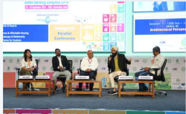
Session 1 - Architectural Perspectives