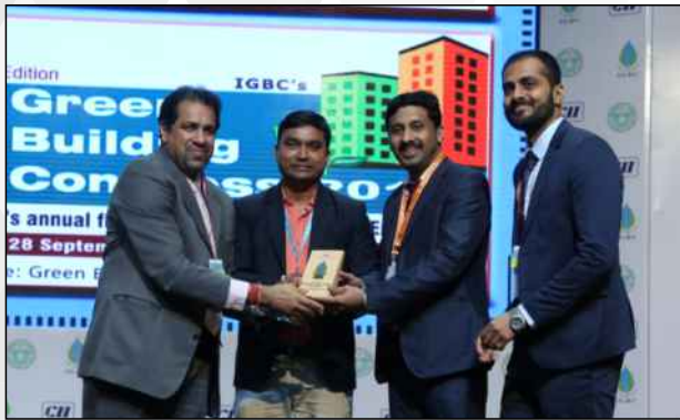
Plant-13 ANNEX BUILDING - Godrej & Boyce Vikhroli, Mumbai