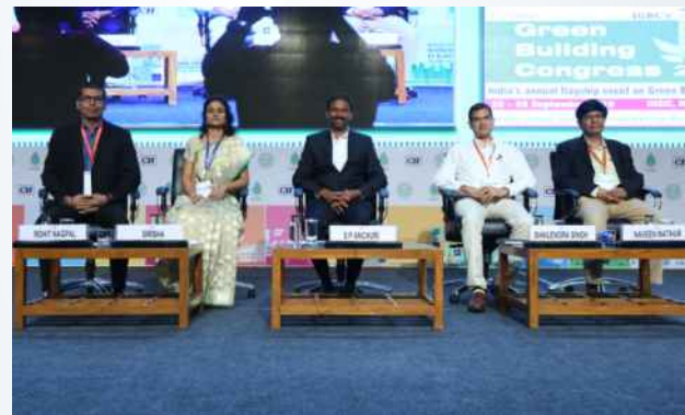
Session 3 - Innovative Solutions