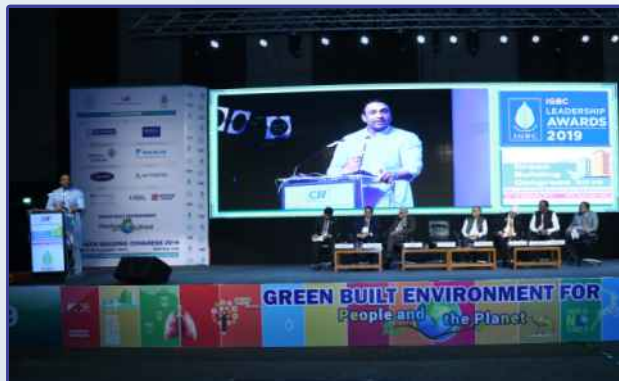
Mr Mekapati Goutham Reddy, Minister for Industries, Commerce & IT, Government of Andhra Pradesh was the chief guest at the session.

The Green Champions have inspired millions of our countrymen in adopting the Path of Green. As a result of their efforts and commitment, today India stands amongst the top 3 countries in the world with a green footprint of 7 billion sq ft.