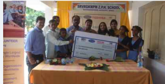
Sri Venkateswara High School, Mukteswarapuram- Andhra Pradesh