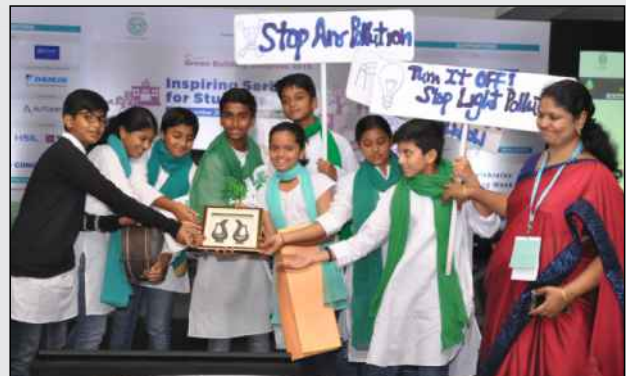
Students performing a theatrical play on dangers of air and water pollution.