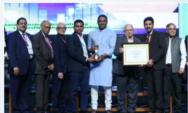
IGBC Performance Challenge Award 2019

IGBC's Green Building Congress - India's only event supported by WorldGBC