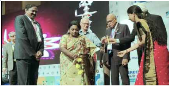
The lamp lighting ceremony during the inaugural session