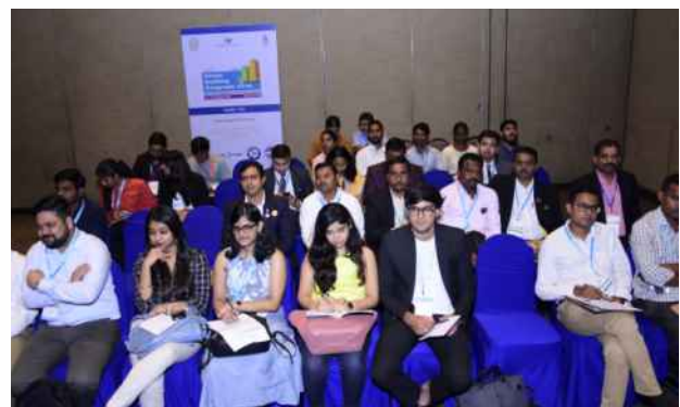
Delegates at the conference.