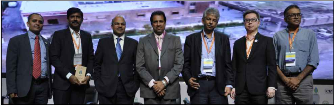
Award of Certified Net Zero Energy Buildings

IGBC had launched the Net Zero Energy Rating System in November 2018 and ever since it has become one of the most talked-about rating systems in the country. IGBC had made significant progress in the Net-zero energy ecosystem in the country. As on date, there are 5 buildings rated under the IGBC Net Zero Energy Rating System including IGBC's HQ Godrej Green Business Centre, Hyderabad. The panel discussion was aimed to discuss the latest advancements in the industry and also showcased some of the successful case studies of IGBC rated net-zero energy buildings in the country.