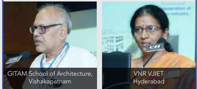
GITAM School of Architecture, Vishakapatnam

Panel 4: Several colleges across India came forward and presented on the green practices being adopted in their college premises along with various activities conducted throughout the year; such as awareness sessions, quiz competitions, IGBC AP preparation and research studies. They received accolades for their contribution and efforts.