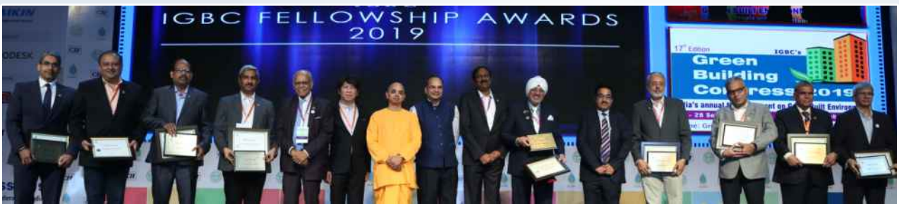
IGBC Fellows and Senior Fellows 2019