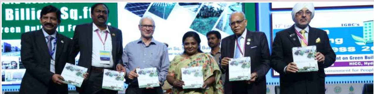
Release of Dossier: 'India GBC achieves 7 Billion Sq. ft. Green Building Footprint' by Hon'ble Governor