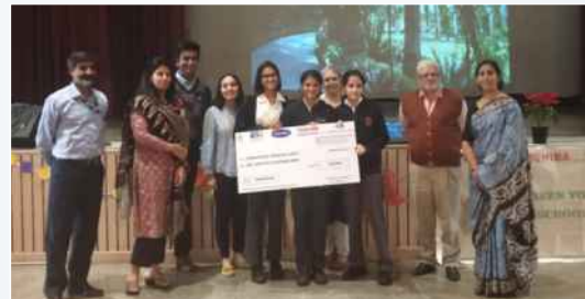
Sardar Patel Vidyalaya, Delhi