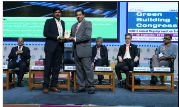
Capgemini, EPIP Campus, Bengaluru