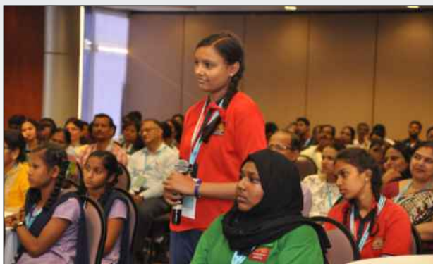
Students also took the opportunity to interact with the speakers and discuss various green ideas.