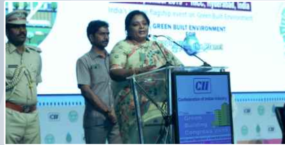
Her Excellency Dr Tamilisai Soundararajan, Hon'ble Governor of Telangana addressing at the inaugural session.