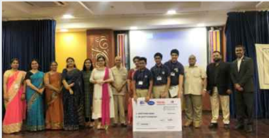
Friends Academy, Mumbai