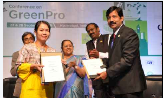
Signing of MOU with 'Green Label: Thailand (Thailand Environment Institute)