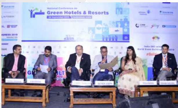
Session 4 - Best Practices & Case Studies – IAQ, Waste and Water Management