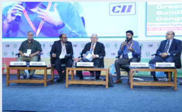
Session 2 - Energy Efficiency in Homes