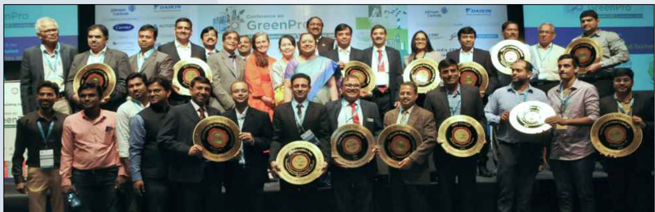
Award of GreenPro Ecolabel to 17 product manufacturers for their green products.