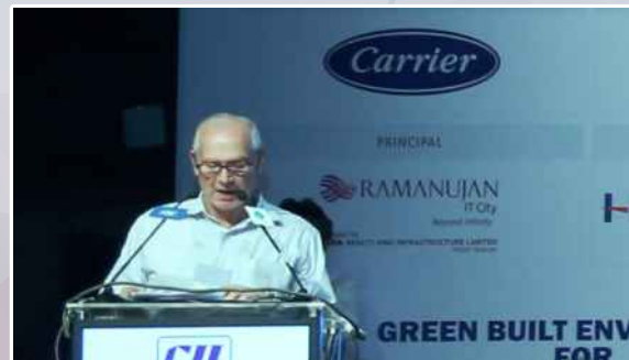
Mr Jamshyd N Godrej, Chairman - CII Godrej GBC, addressing the session