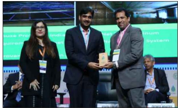
Globicon Terminals, Navi Mumbai