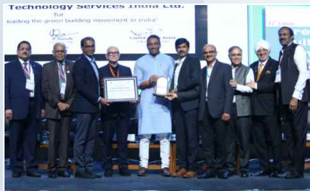
Green Champion Award 2019