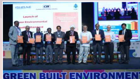
Launch of 'Indoor Environmental Quality Standard'- a publication by The Indian Society of Heating, Refrigerating and Air Conditioning Engineers (ISHRAE)