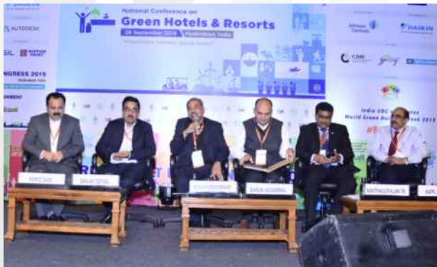
Session 3 - Energy Efficiency – Challenges and Opportunities in the Hospitality industry